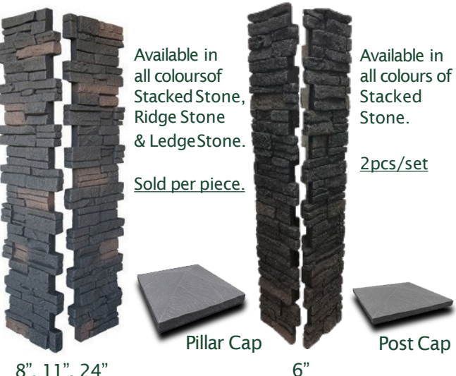
8", 11", 24"