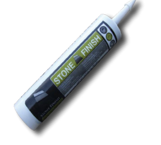
Stone Finish Caulking