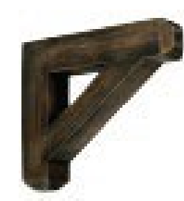
Interior/Exterior Primed and ready for paint or stain.